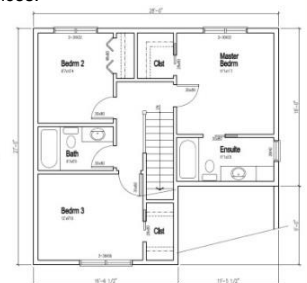
Single-family (second floor)