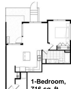
1-Bedroom, 716 sq. ft.