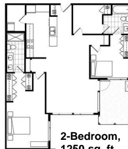
2-Bedroom, 1250 sq. ft.