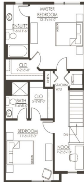
Phoenix B. Unit: 1405 sq. ft.